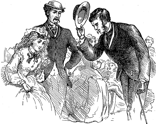
"Let me present my friend, Mr. Seymour."

Carryl came up with the lady and his arm; and as he stood there for a moment, in the coolest, most indifferent tone in the world, said, "Oh! by the by, Miss Ellis, let me present my friend Mr. Seymour."